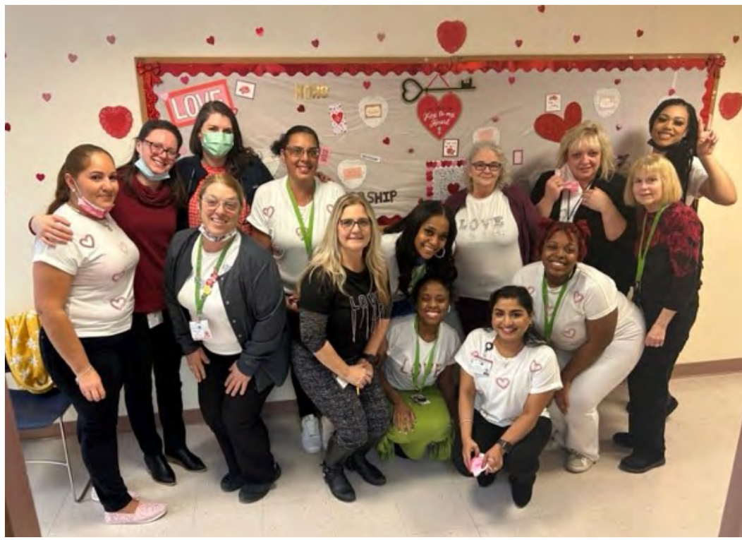
Staff at 920 Lark celebrate Valentine's Day