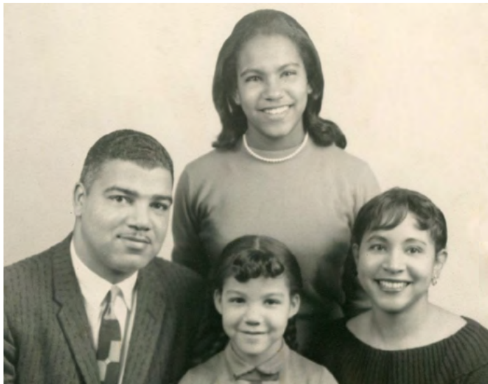
Whitney M. Young, Jr. with his wife Margaret Buckner Young and their two daughters

Named executive director of the Urban League in 1961, Young became known as an influential Black activist who helped bridge the gap between white political and business leaders and disadvantaged Black Americans and those advocating for their rights. Under his direction, the Urban League grew from 60 to 98 chapters and shifted its focus from middle-class concerns to the needs of the urban poor. He almost single-handedly persuaded corporate America and major foundations to aid the Civil Rights movement through financial contributions in support of self-help programs for jobs, housing, education, and family rehabilitation.