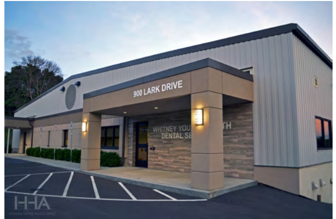
Our Dental Practice at 900 Lark Drive

As access to care in the Capital District narrows, the WYH Dental team is finding ways to expand dental services and minimize the need to refer patients to other clinics for dental care. Our services include exams and cleanings, scaling and root-planing therapy, basic restorative care, prosthetic care (dentures, crowns, bridges), extractions, and basic root canal therapy and surgical extractions. In the next year, our team will be working to offer nitrous oxide to patients with disabilities, dental anxiety, and behavior management challenges.