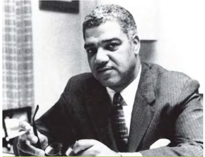
Whitney M. Young, Jr.

Although his name is not as well known, Young is enshrined as one of the Civil Rights Movement's "Big Six" activists. Alongside other prominent figures such as Martin Luther King Jr., John Lewis, A. Philip Randolph, James Farmer, and Roy Wilkins, Young was a catalyst for social change in the United States during the Civil Rights Movement. Young, often referred to as the "Powerbroker" of the Civil Rights Movement, would frequently participate in meetings with government officials, including United States presidents, to advocate for African Americans and people of color across the country.