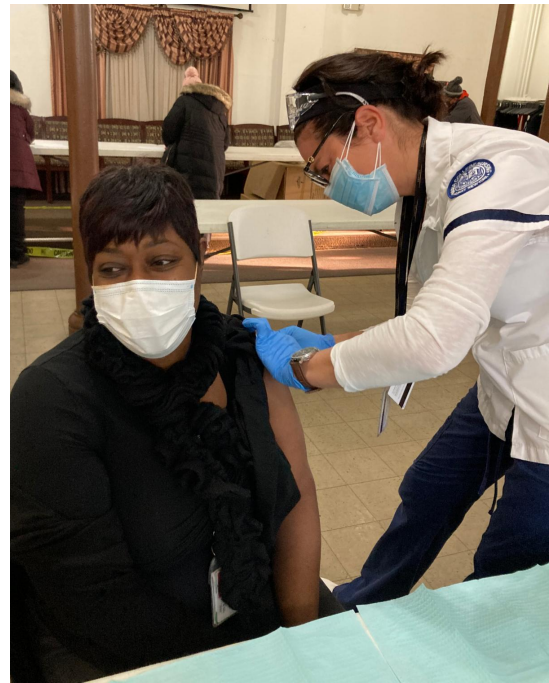
A nursing student from Maria College administers the COVID-19 vaccine at Sweet Pilgrim Baptist Church in Albany.

The first WYH/Maria College collaborative clinic was held at Sweet Pilgrim Baptist Church in Albany, a location selected as part of a statewide effort to make the vaccine available and accessible to Black and brown communities.